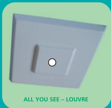
ALL YOU SEE - LOUVRE

All you see is a slim unobtrusive louvre, not a large piece of machinery that takes up floor space and has to be moved around.